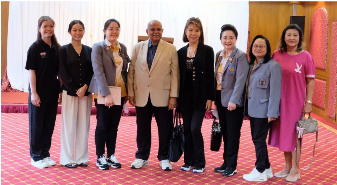
The female team helpers of the organizing committee...