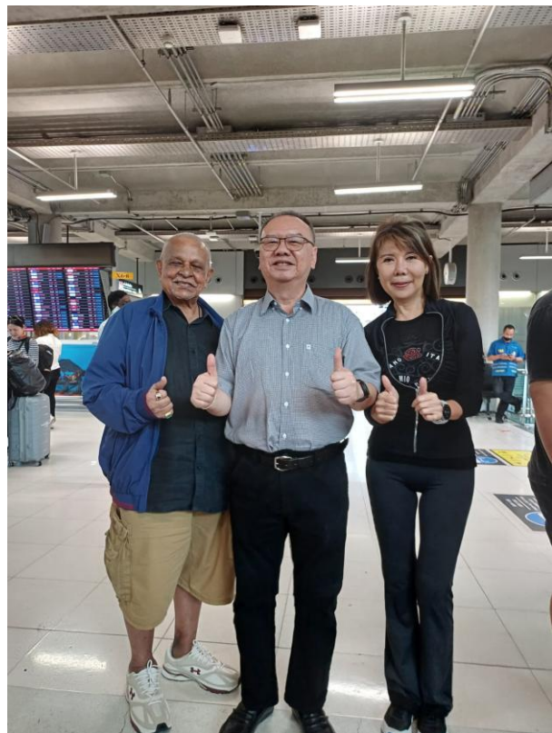
At the Suvarnabhumi Airport...